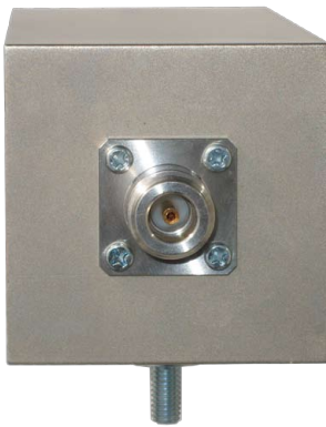
RSG 3000, view to the N connector