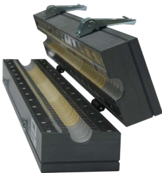
KEMA 801A, side view